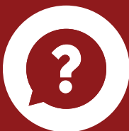
Exhibit and Sponsorship Fulfillment Questions?

Education Opportunities (312) 673-5929 jeustice@pedsnurses.org